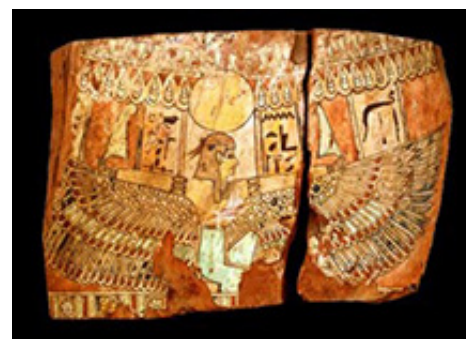
Coffin Fragment Depicting Isis Egyptian, Ptolemaic period, ca. 100–50 BCE Wood, gesso, pigment Gift of Philip Pearlstein (82.433 a–b)